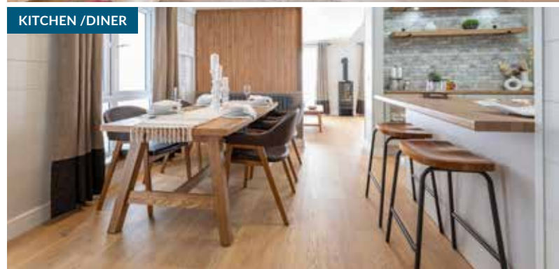
KITCHEN / DINER