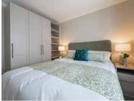
OMAR REGENCY PARK HOME