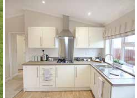
OMAR NEWMARKET PARK HOME