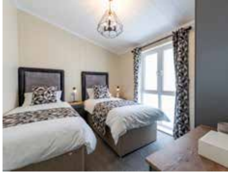
OMAR KINGFISHER LUXURY LODGE