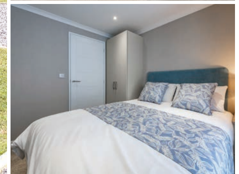
OMAR IMAGE PARK HOME