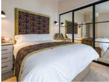
OMAR IKON PARK HOME