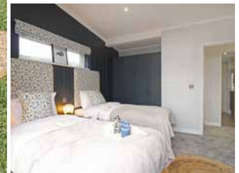
OMAR HERON LUXURY LODGE