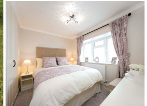
OMAR ELVEDEN COTTAGE PARK HOME